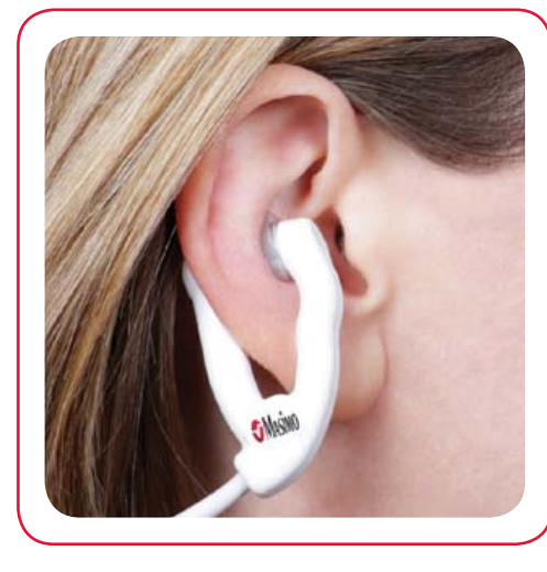
Figure 2. The tip of the E1 sensor is placed on top of the high perfusion area in the Cavum Conchae